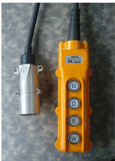
Wired Remote Control (Option)